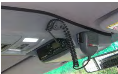
Microphone clip on slight angle

Install in a position that suits best, depending on vehicle and Radio model. Ensure microphone or microphone cable and holder does not foul on sun visor when pulled down.