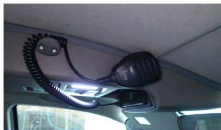
Left hand cable outlet radios