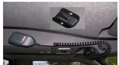
Microphone clip on acute angle